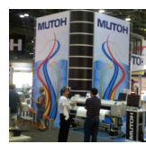
Trade Show Displays