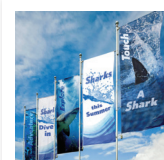
Point of Purchase